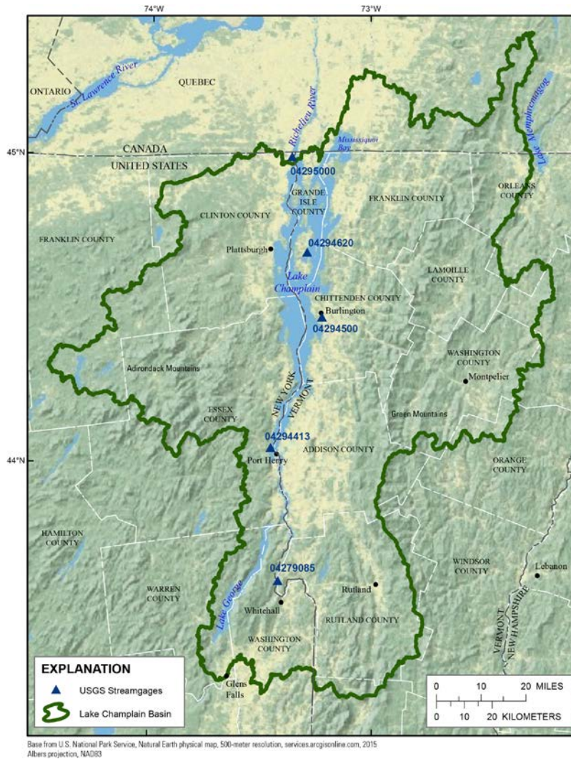
Figure 1. Lake Champlain Watershed and U.S. Geological Survey lake gages; from U.S. Geological Survey (2013)

The Lake Champlain static flood inundation maps are intended to aid residents in assessing the extent of flooding based on the stage as shown on the USGS gage web sites and, in the case of the Richelieu River (Lake Champlain) at Rouses Point N.Y. lake gage 04295000, as predicted by NWS. One way to address the informational gaps in flood extent is to produce a library of flood-inundation maps that are referenced to the stages recorded at the USGS lake gage. By referring to the appropriate map, emergency responders can discern the severity of flooding (areal extent), identify roads that are or